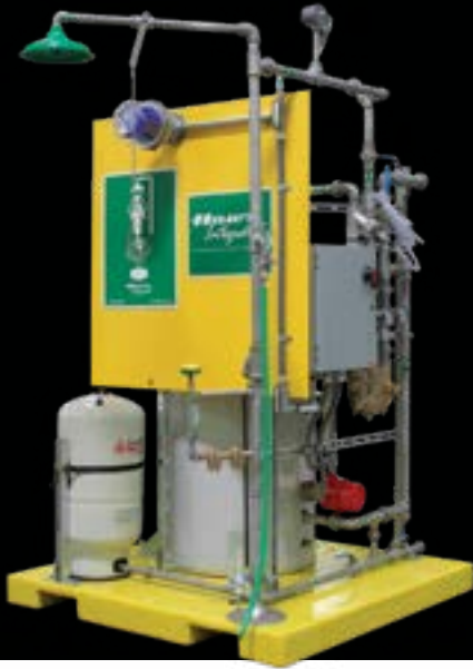
Model shown with additional light/alarm