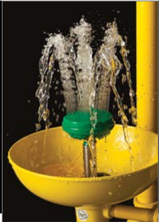
AXION Advantage eye/face wash head installed on Bradley Model S19-310FW

Designed to upgrade your facility's emergency eyewash and shower systems, the AXION Advantage improves existing emergency equipment while maintaining ANSI compliance (when properly installed).