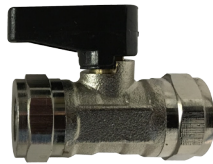
FIP X FIP