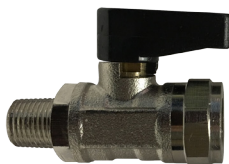
MIP X FIP