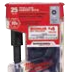
25 Pack + Bit Holder