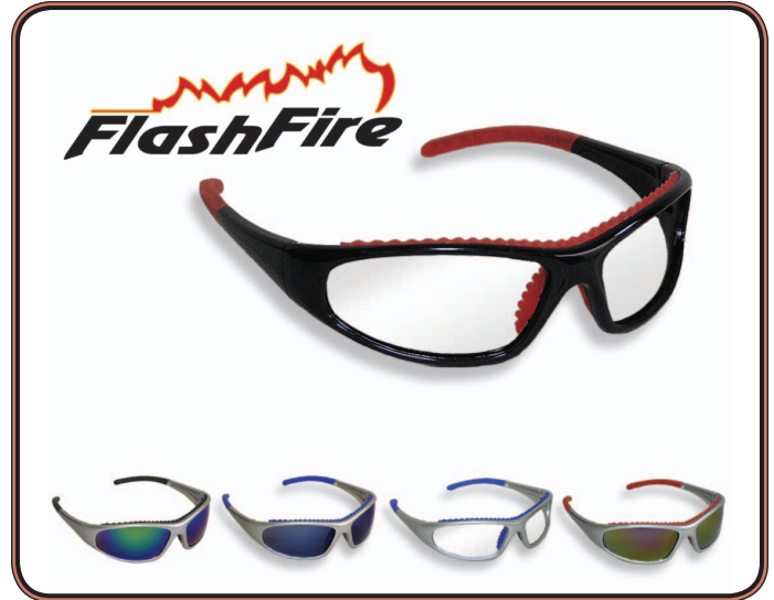
Polycarbonate lenses block 99.9% of the sun's ultraviolet rays. This ultraviolet protection has already been incorporated within the lens material when the lenses are being produced.

Country of Origin/Harmonization Code: Taiwan/9004.90.0000