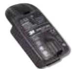
IS Rechargeable Lithium-ion Battery