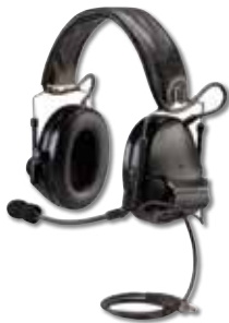
DUAL COMM SPLIT AUDIO*