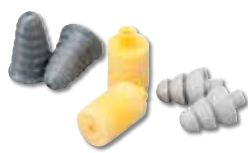
Replacement Communication Eartips