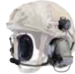
COMTAC ACH, Olive Drab Green Earcups, Single Comm with FAST Hard Hat Mounting Attachment