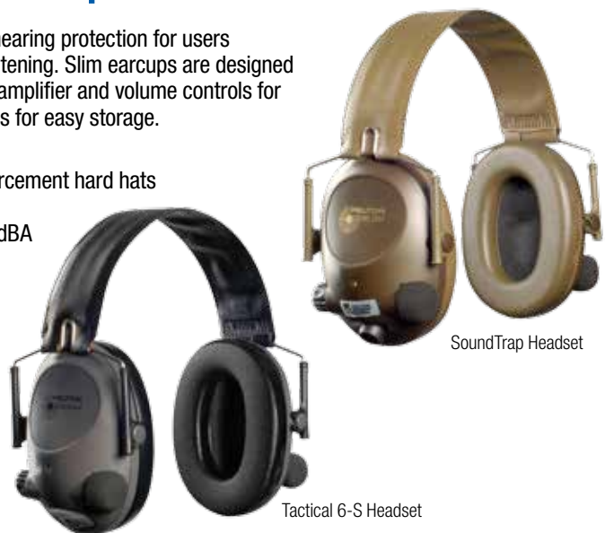
Tactical 6-S Headset