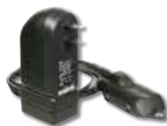
Rechargeable Battery Pack