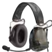
COMTAC ACH, Olive Drab Green Earcups, Single Comm