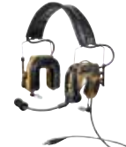
COMTAC IV, Coyote Brown Earcups, Single Comm