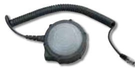
Remote Big Button PTT