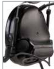
Covert Black (SWATTAC)