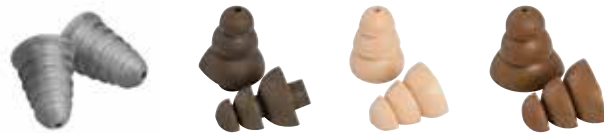
Replacement Communication Eartips