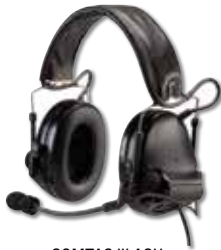
COMTAC III ACH